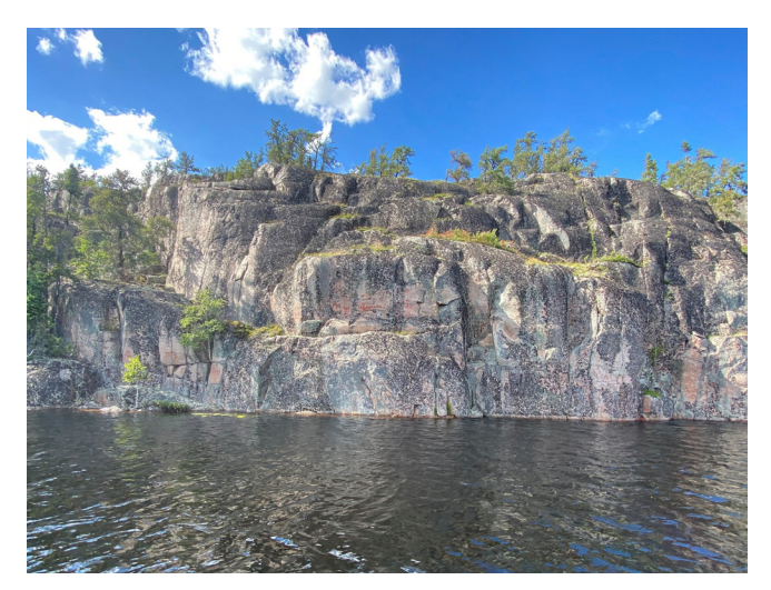
Rock paintings at Paimusk Creek