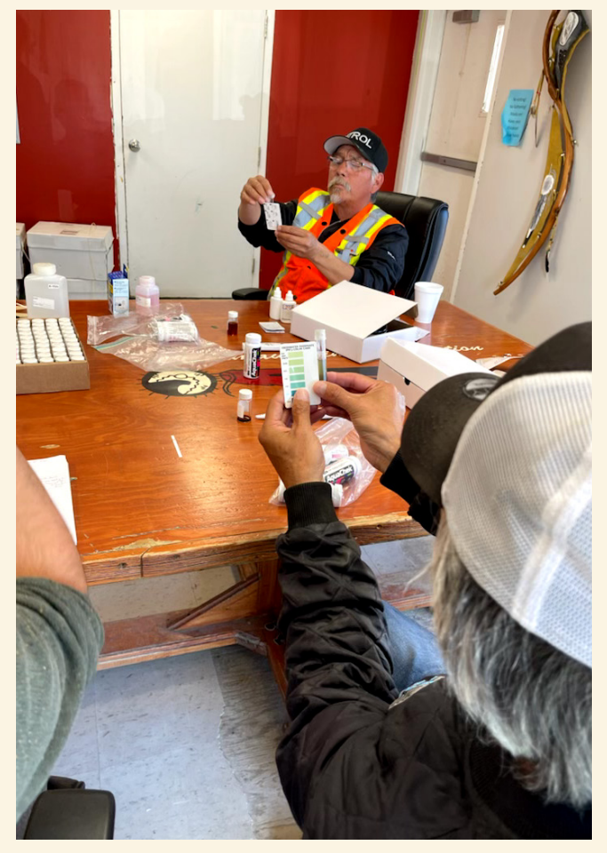
Water monitoring training held June 2022

"Since being moved from Old Post and coming to our new area we've had to restart this work." - Sheldon Bourassa, CCN Councilor