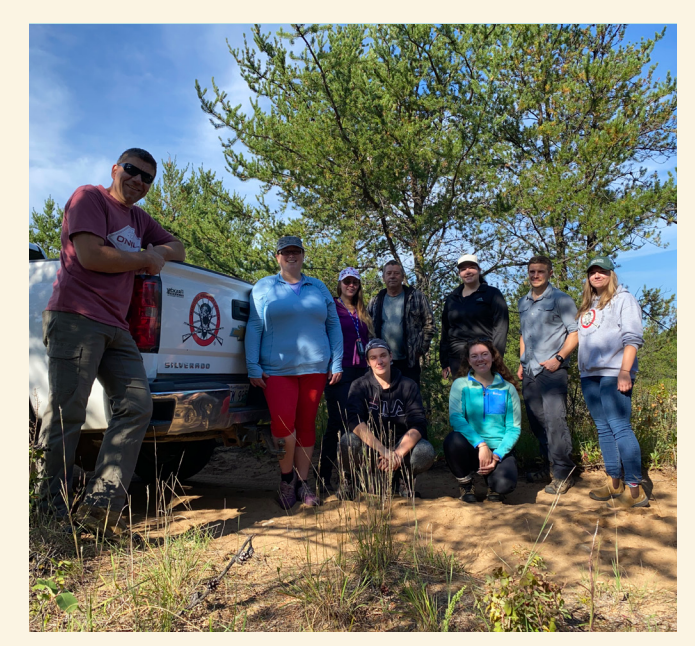
MMF staff, youth, and knowledge holders gathering at site of interest