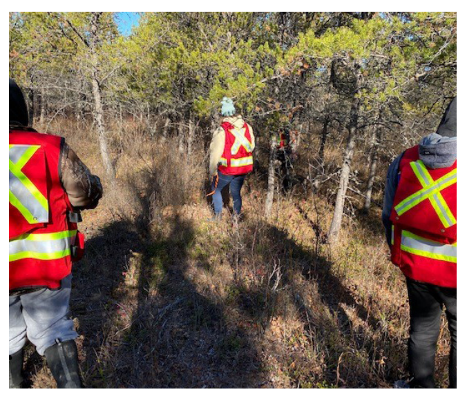
Forest carbon inventory training