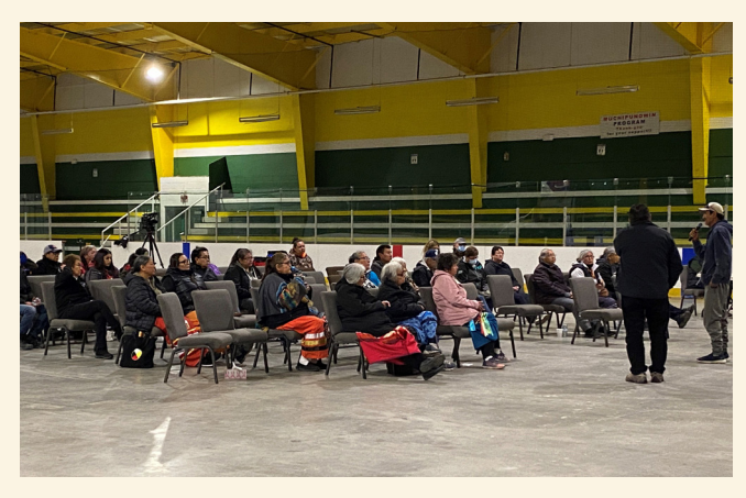
Ground-penetrating radar kickoff event

"For many years, our people enjoyed the pristine nature of our lands and resources, until the governments and industry greatly impacted all our lands, resources and way of life. Our elders tell and remind us to get back to the land to heal ourselves and know who we are. We must help take care of all our lands and resources, and lead a healthy mino pimatisowin."