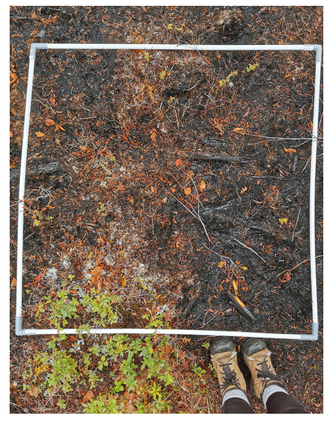
Vegetation quadrats used in monitoring program

"Years ago, when I was younger, I would come up through here.... especially around end of July, early August. It'd be nothing to see anywhere from 300-1,000 people up here picking berries and camping, this whole area used to become like a little community all over." - Bob Church, Red River Métis Harvester and Knowledge Holder