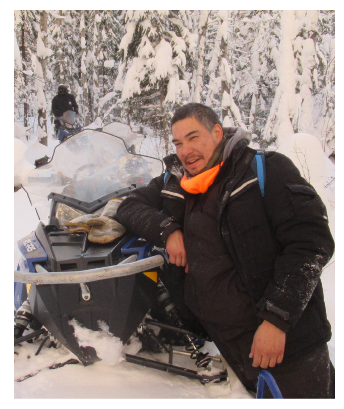
NCN Guardians on patrol