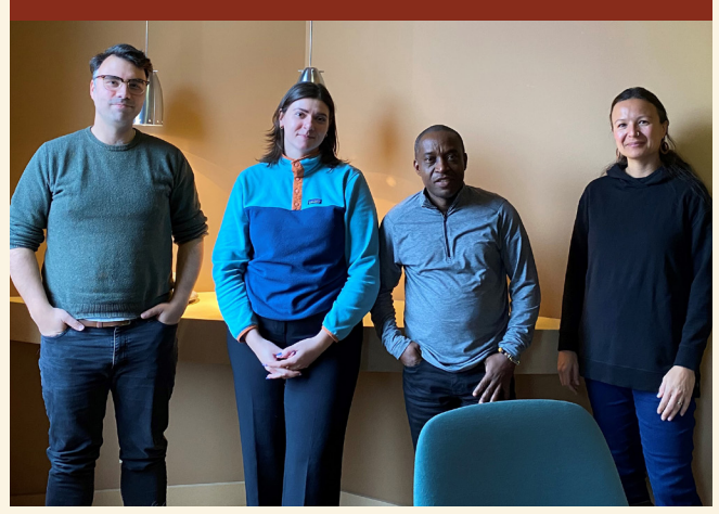
@ Nature United